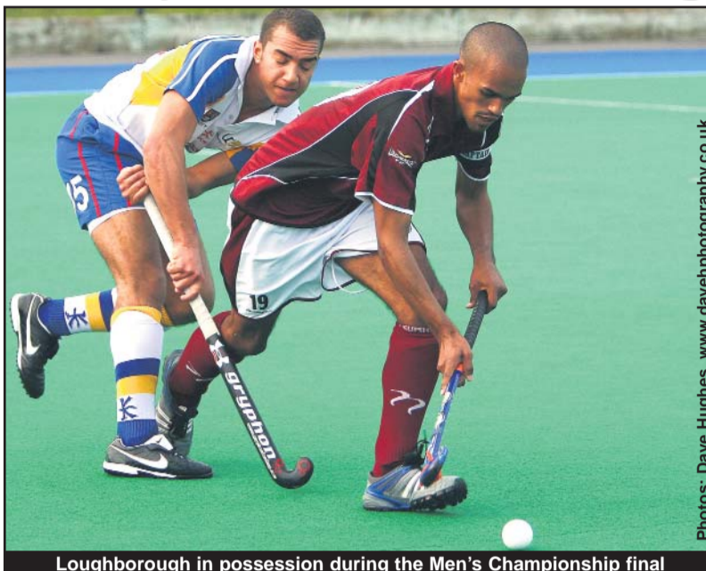
Loughborough in possession during the Men's Championship final