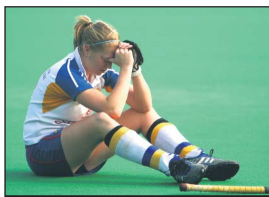
A Birmingham player after their golden-goal defeat

There was to be no upset though, as the seconds scored four first-half goals on their way to a 6-0 win. Stirling beat Exeter seconds 3-2 to win the Men's Shield final, with Newcastle defeating Kent 2-1 to win the Women's Shield.